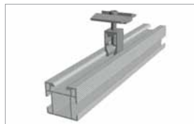
Module clamp with clickstone