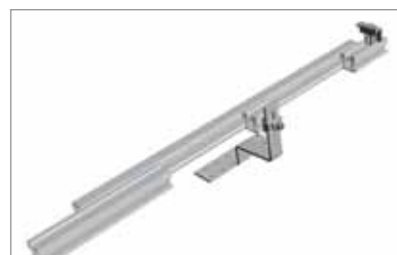
Telescoping end piece