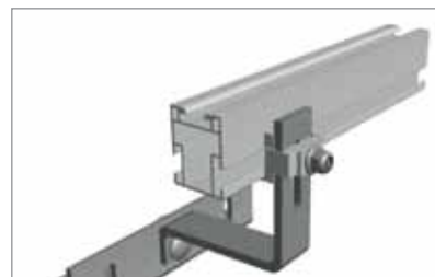
Roof hook with rail connection